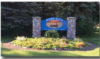
The new welcome sign on Hwy 61 was installed in July.

Have you noticed the new Welcome Signs located on 4th Street and on Hwy 61? Thanks to a grant the City received from the Thriving Communities Initiative, we were able to add these new signs to welcome people to our fair city. These signs are in addition to the new directional signs that were installed in 2015 which identify where popular destinations such as the Aquatic Center, Community Center and Industrial Park are located. The 4th Street welcome sign will be completed soon and landscaping will also be added.