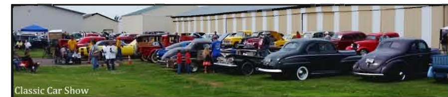
Classic Car Show