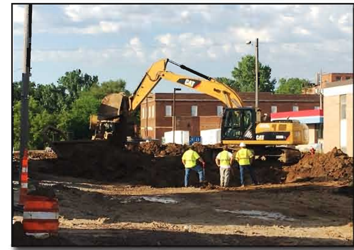
Construction work on 5th Street and Eliot Avenue is expected to be completed in September.