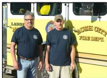
The Rush City Fire Department is looking for new recruits to serve the community and help save lives.

Do you have a drive to serve your community on the Rush City Fire Department? This all volunteer department is currently looking for men and women to be part of this highly professional and progressive organization. Rush City fire fighters must be at least 18 years of age, a high school graduate or equivalent, reside 10 minutes or less from Rush City, possess a valid MN drivers license and pass a criminal background check. Employment applications can be found online at www.rushcitymn.us under the "information" tab. All training, uniforms and equipment are provided at no cost. Applications will be accepted through October 31, 2016. Join us at the Fire Department Open House on October 16th to meet the fire fighters and to learn more information about becoming a fire fighter.